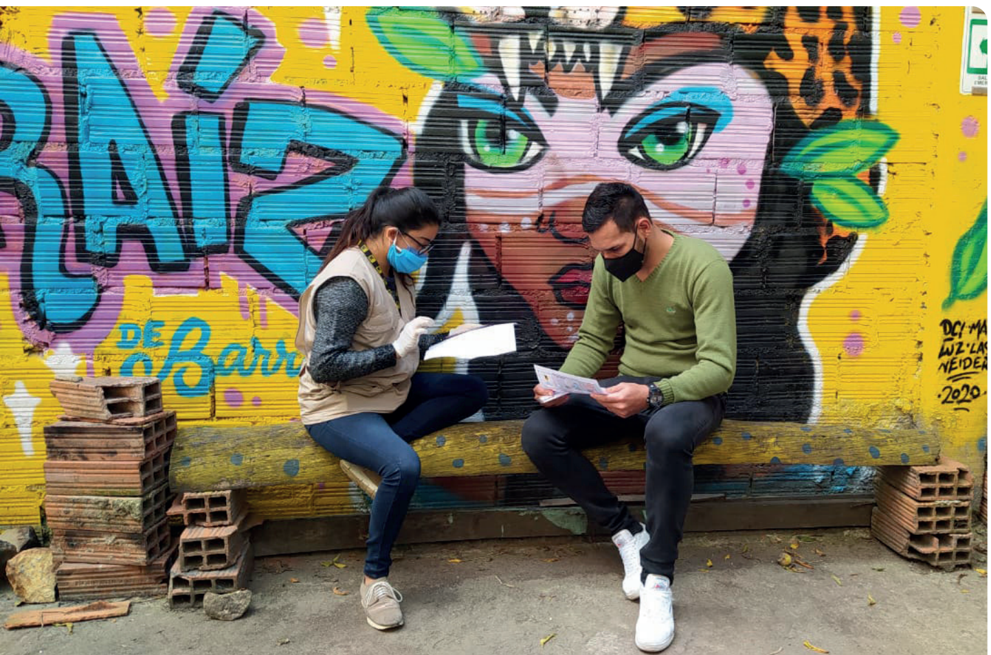
Bogota, Colombia – IRC

While the focus of the research was on governments, humanitarian and development partners - as well as broader civil society at the global, regional, and country level - were engaged to get their perspectives on research questions. The research did not include engagement with local civil society actors and refugee and host communities themselves, given the target of governments. Their perspectives and important voice, particularly when discussing the impact of changes in refugee policy and practice, should be included in follow-up regional and country research on GCR implementation.