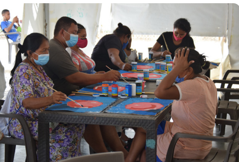
Colombia – DRC

The true trendline insofar as third country solutions are concerned will only become clear once international travel returns to some semblance of pre-pandemic levels and major events, such as the resettlement of Afghan refugees, are discounted as exceptions. Over the course of the last few years, a number of other countries have signalled their commitment to third country solutions as crucial tools for protection and solutions.